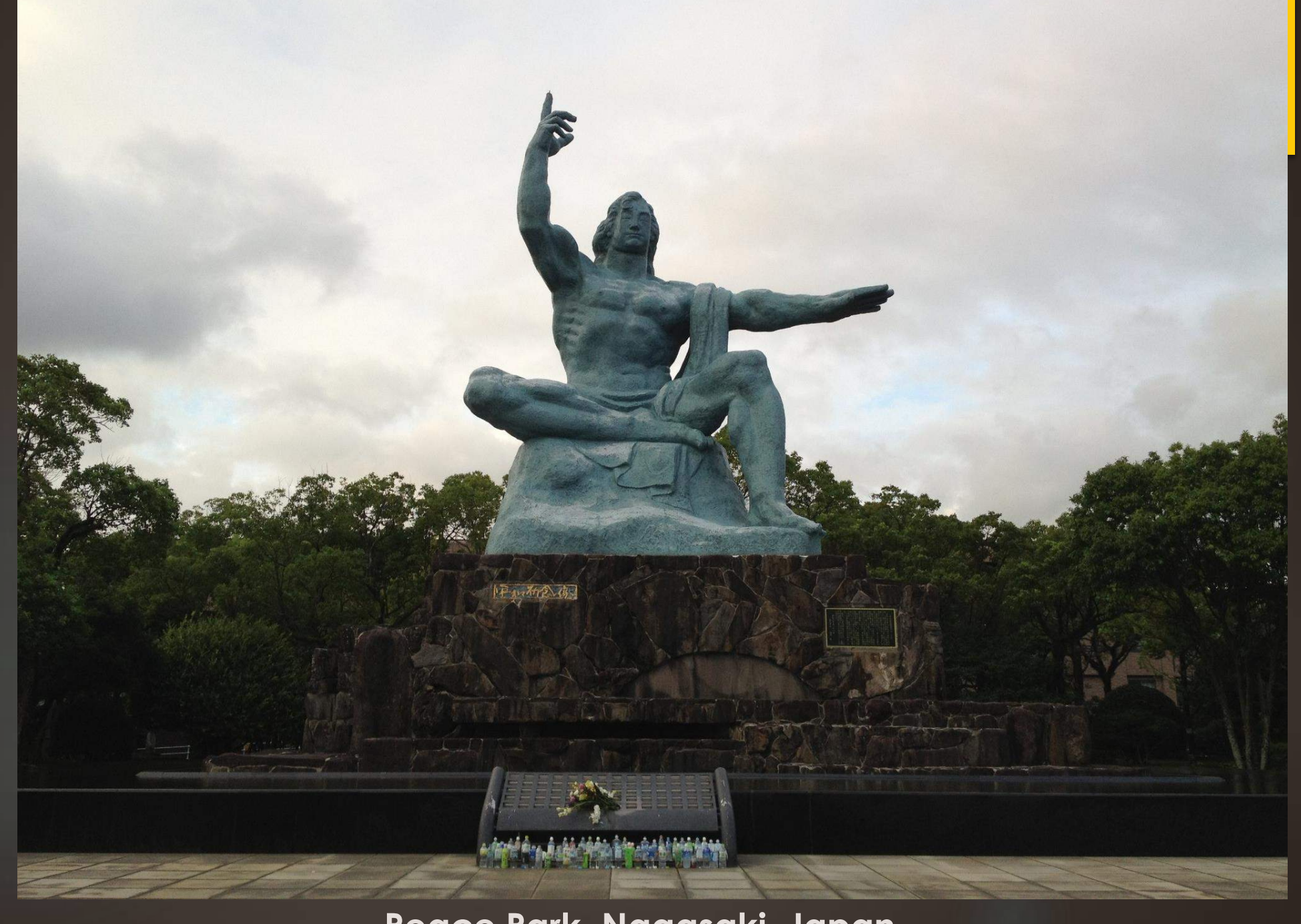
Peace Park, Nagasaki, Japan