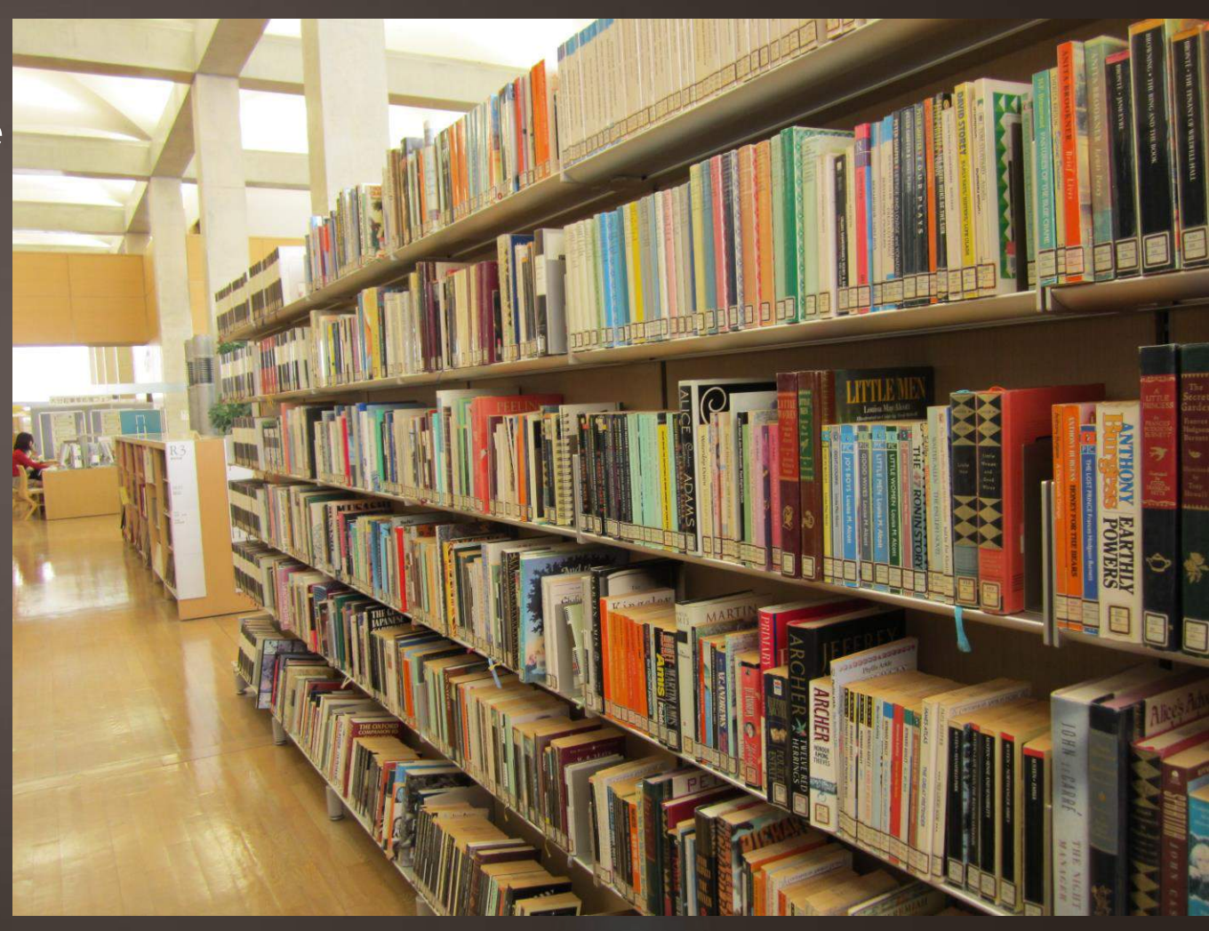
Public Library, Oita, Japan