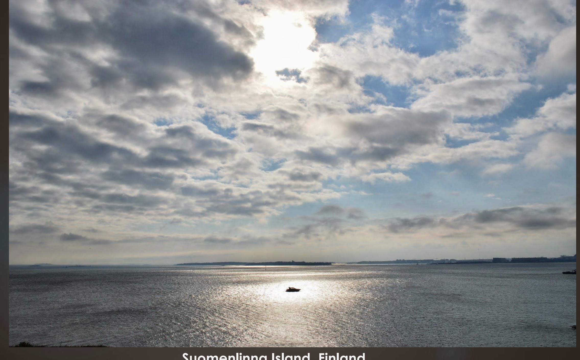
Suomenlinna Island, Finland