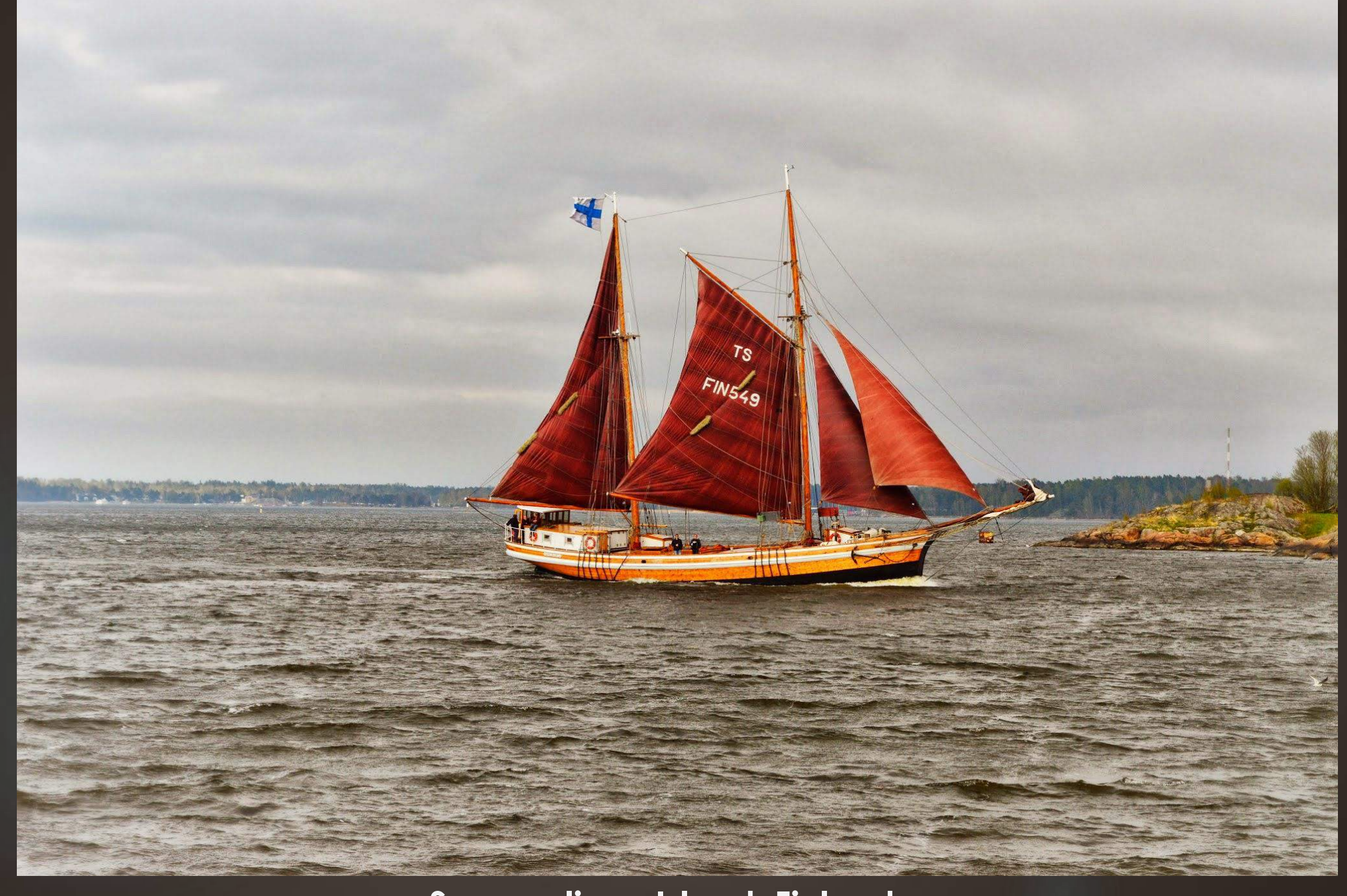
Suomenlinna Island, Finland