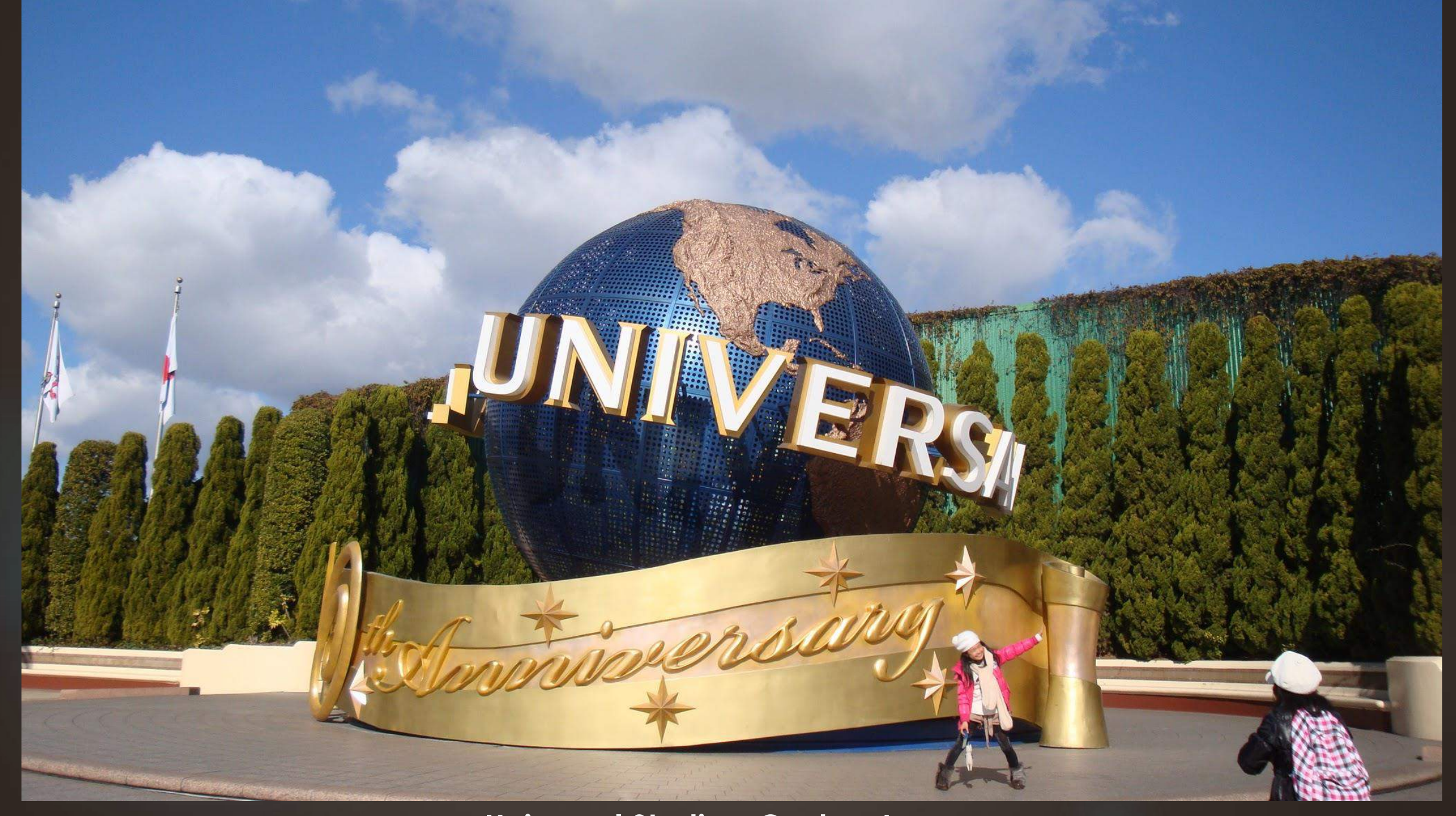
Universal Studios, Osaka, Japan